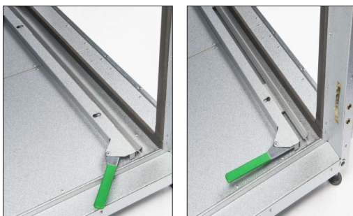
Filter clamping device with safety mechanism; service hatch will not close if the levers are not secured